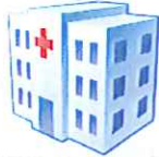
Genesys Health System

In our region, our local hospitals have also selected different EMR vendors to achieve "meaningful use" requirements. Each regional hospital's selected EMR system for employed physicians is noted below. We fully endorse and encourage your use of these EMR systems if your practice is in the process of making such a decision.