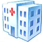
McLaren Health Care

Allscripts Enterprise or Professional or MyWay EMR