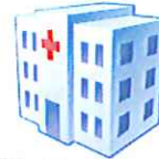
Hurley Medical Center

Allscripts Enterprise or Professional or MyWay EMR